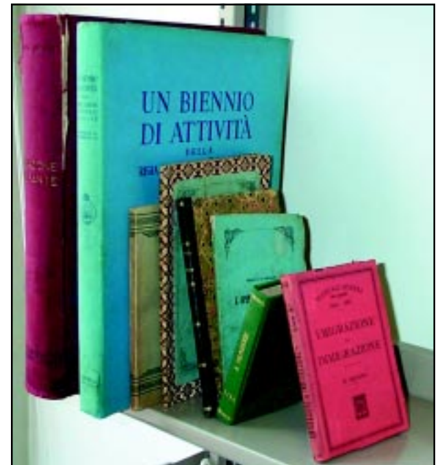
Select volumes from the Saraceno Collection donated to the Italian American Museum

Acting Executive Director of the John D. Calandra Italian American Institute, looks forward to the Library's opening. "The addition of this unique and outstanding collection dedicated to Italian history complements our growing Italian American collection and fulfills our mission as an academic research institute and scholarly resource."